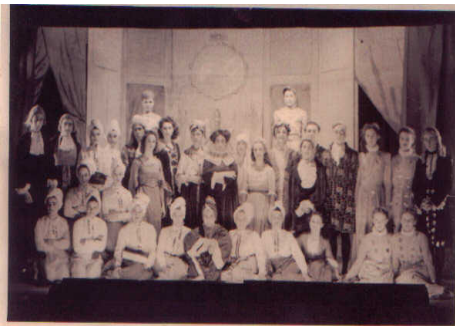
SPEECH DAY DRAMA

----- Any ideas on who's who in this photo?